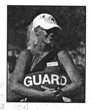
Voted Friendliest Staff