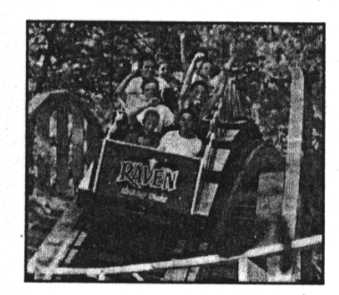
The Raven: Voted one of the Best Wooden Coasters

Thank you to the staff and to all the readers of Amusement Today for this honor. As the first-ever recipient of the Golden Ticket Award for Friendliest Staff, we'd like to thank all of our staff members for a job well done.